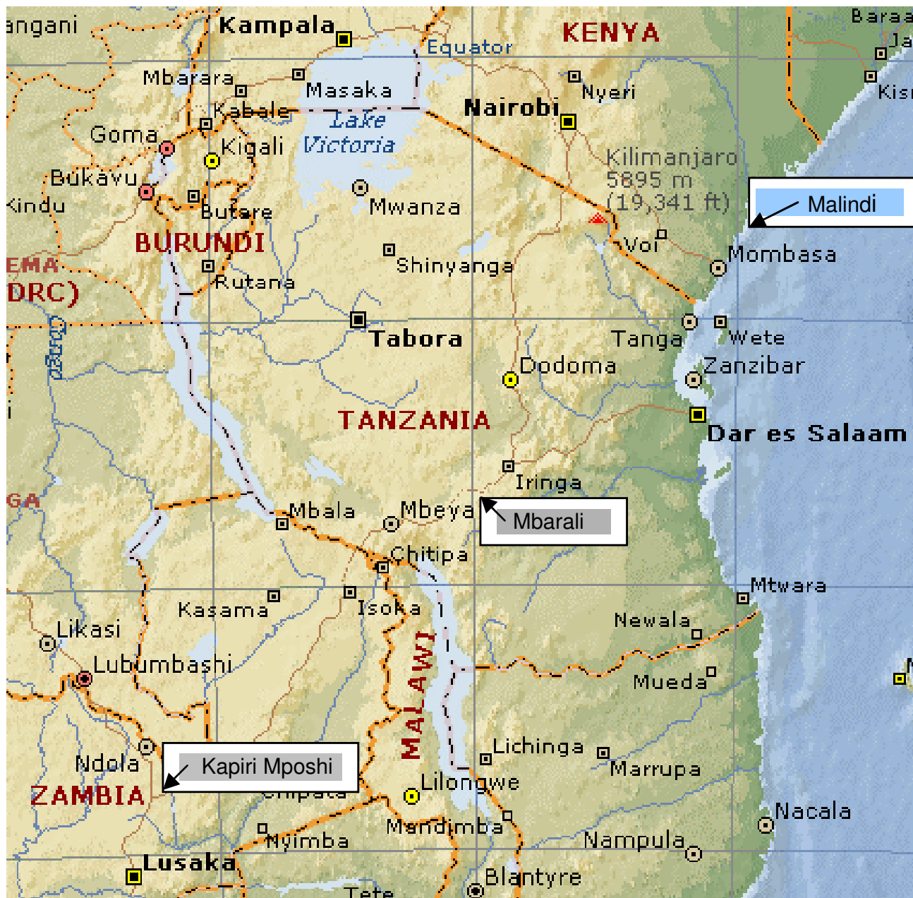
Figure 3 District locations.

The project applies AFR through a participatory and interdisciplinary action research design. Each study district represents a case, in which decision-making is studied from