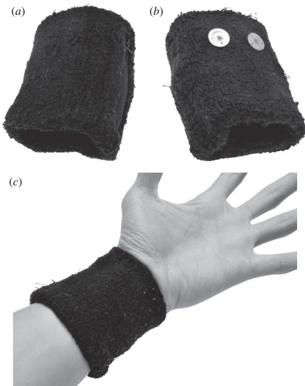
Figure 1. Wearable EDA sensor. (a) Sensor is inside stretchy breathable wristband. (b) Disposable Ag/AgCl electrodes attached to the underside of the wristband. (c) The EDA sensor can be worn comfortably for long periods of time.

making eye contact (he asked me, in a part that didn't get aired, why I didn't just look at him, and he was, I think in an attempt at friendliness, leaning into me the whole time in a way that was making me very stressy indeed, too stressed out to fully explain to him the effect he was having on me). I also wish I had one of those devices to play with for longer. It sounds as if they could be really useful in learning what stresses me out before it reaches the point that I notice it. I also wonder if showing readings like that to the sort of professionals who are heavily invested in forcing eye contact and other invasively direct forms of interaction on autistic children would make them think twice about it.