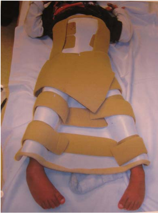
Fig. 3 Custom-molded total body splint

of this deformity with internal rotational osteotomy of the tibia should be considered when external torsion is greater than 20^\circ [40]. We use the same technique as for correcting internal torsion. In addition, it is essential to examine the patient's entire lower extremity, paying particular attention to the hindfoot, as we have noticed a correlation between external tibial torsion and hindfoot valgus. Often, both deformities require treatment in order to achieve a successful result. Treatment of the hindfoot valgus consists of a medial sliding osteotomy of the os calcis.