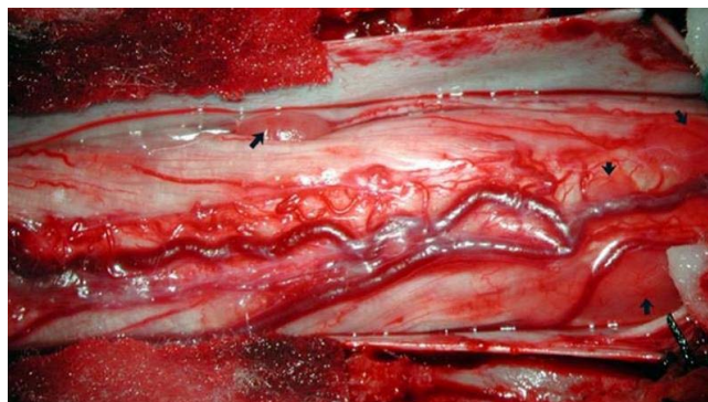
Figure 2 Intraoperative photograph of multiple ependymomas in the region of conus medullaris and cauda equina (arrow).

nia cavity [2,3]. Rare cases of tumor spread from the spine retrograde to the cranium [4] and extraneural spread to liver and lungs from the spine have been reported in literature [5].