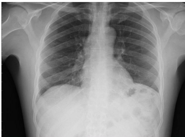
Figure 1 Chest x-ray showing no evidence of active pulmonary disease.

breaths per minute. Oxygen saturation was 95% on room air, which decreased to 90% during ambulation. There were no oral lesions. His neck was supple. Examination of the lungs revealed bilateral expiratory wheezes and rare rhonchi. Cardiac examination demonstrated normal first sound, second sound with a regular rhythm and no murmurs. His abdomen was soft, nontender, nondistended with normoactive bowel sounds. His extremities were warm and his skin was dry with multiple small herpetic ulcers on the left ear and the left side of the face.