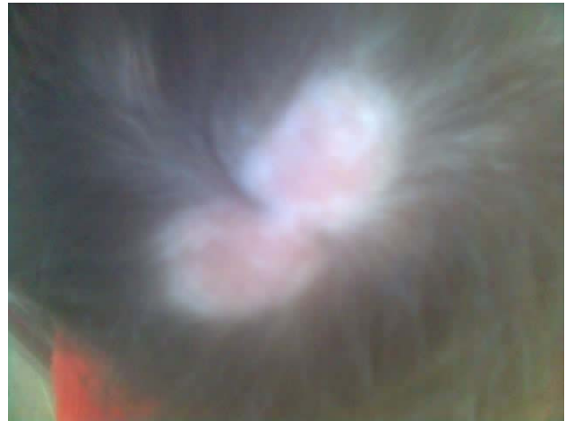
Figure 1 The parietal part of the scalp appear two oval shaped areas without hair, confluated, with light depth and shiny bases.

Consultant orthopedist concluded the digiti V superductus pedis bilateralis, laxitas articularum generalisata and Sy Floppy (Figure 3a and Figure 3b). Consultant neurologist indicated minor visuomotor discoordination. Cardiologists and nephrolog consulting resulted on the common stage. Cytogenetic report has shown Cariotype