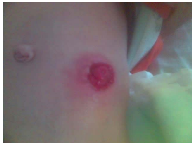
Figure 2 Installed stoma (anus praeternaturalis).

Aplasia cutis congenita is very rare anomaly (1:3000). Causes of congenital aplasia could be teratogenic sub-