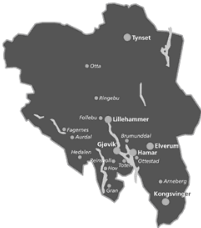
Figure 3 Hospital units in the Innlandet Hospital Trust.

The motive was the situation around Lake Mjøsa. Attempts to coordinate across the county borders have been made for decades, but it was not possible under the old ownership. In 2002, we saw the outline of the same problem occurring between the hospitals. ix Gathering all the hospitals in one trust was a deliberate organizational strategy.