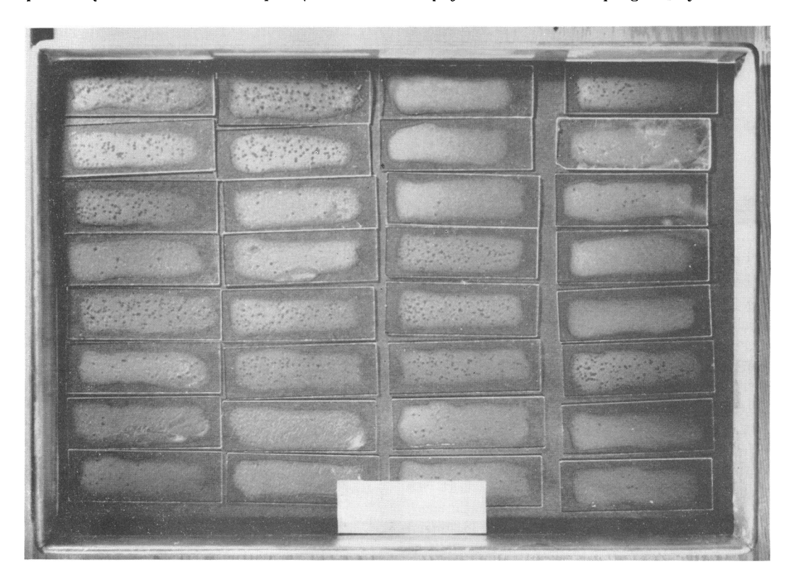
Figure 1. Tray modification of Jones-Krueger plaque count method; arrangement of slides and appearance of plaques after overnight incubation at 28 C, using Staphylococcus aureus K_1 and phage P_1 .

more reliable than the Gratia procedure with a Staphylococcus aureus K_1 -phage P_1 system.