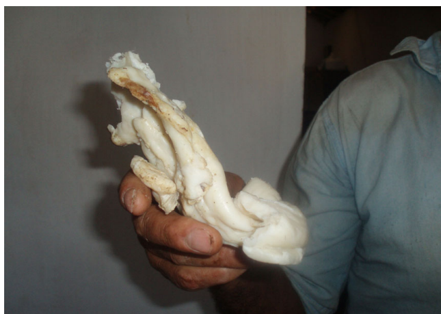
Figure 3 Suet derived of the Ovis aries (Ram) used in Ethnoveterinary medicine in municipality of Pocinhos, semi-arid region, NE Brazil.

animals and pets, some of them are: cow/cattle, sheep, goat, horses, dogs, pigs. Examples can be viewed in figure 4. Most of the interviewees affirm that the zootherapies can be used to cure diseases that affect all domestic animals and pets.