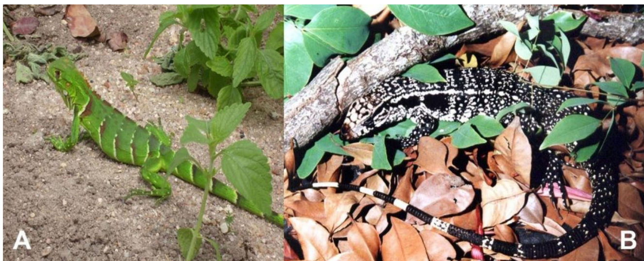
Figure 2 Examples of animals used in Ethnoveterinary medicine, semi-arid region, NE Brazil, A - Iguana iguana (Common Green Iguana); B - Tupinambis meriana (Lizard, "teju").

These species were used to treat 11 different diseases. The most cited diseases were: tumors, furunculosis (n = 9 citations); snakes bites (n = 8); thorns (n = 5); wounds (n = 4); scabies (n = 4); "Estrepes" (suck a splinter out of skin), (n = 4); and harmed areas (n = 3). The diseases quoted during the interviews affect as much as livestock