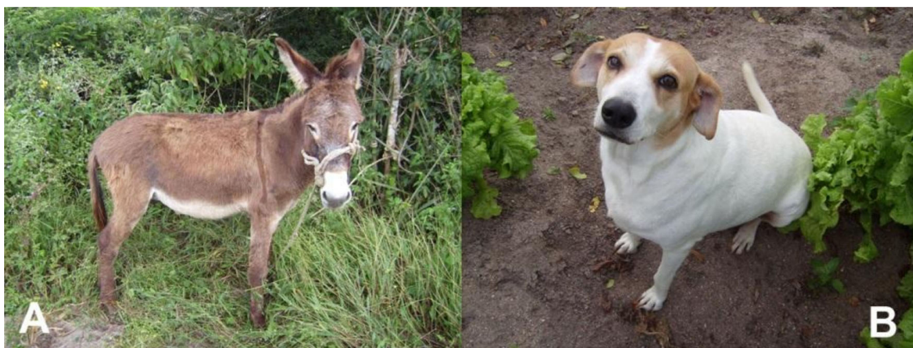
Figure 4 Examples of animals treated in Ethnoveterinary medicine, semi-arid region, NE Brazil, A - Equus asinus (asino); B - Canis lupus familiaris (dog).

closely linked to historical factors and medicinal knowledge traditionally focuses on local species, reflecting the transmission of knowledge through many generations, while financial restrictions limit access to exotic resources [27,55,56].