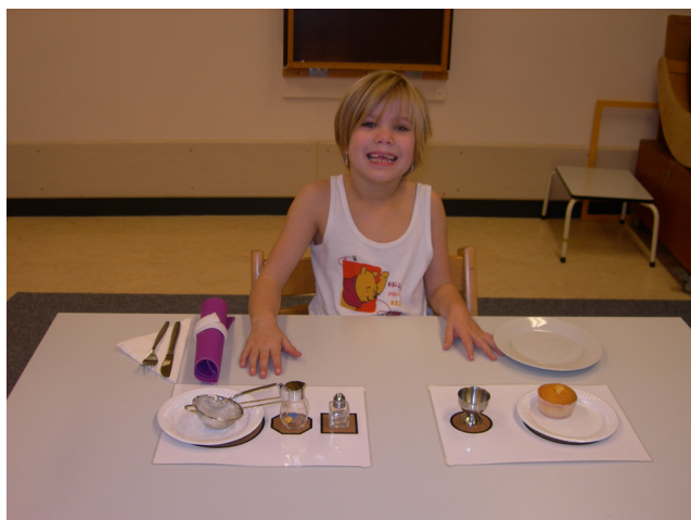
Figure 2 A five-years old child decorating a muffin.

end the task by cleaning the hands with a napkin (subtask 8). Age group 1 was not required to use the placemat and the cutlery. This difference resulted in seven subtasks for age group 1 and eight subtasks for age group 2.