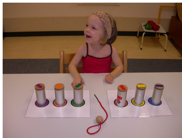
Figure 1 A two-years old child stringing beads.