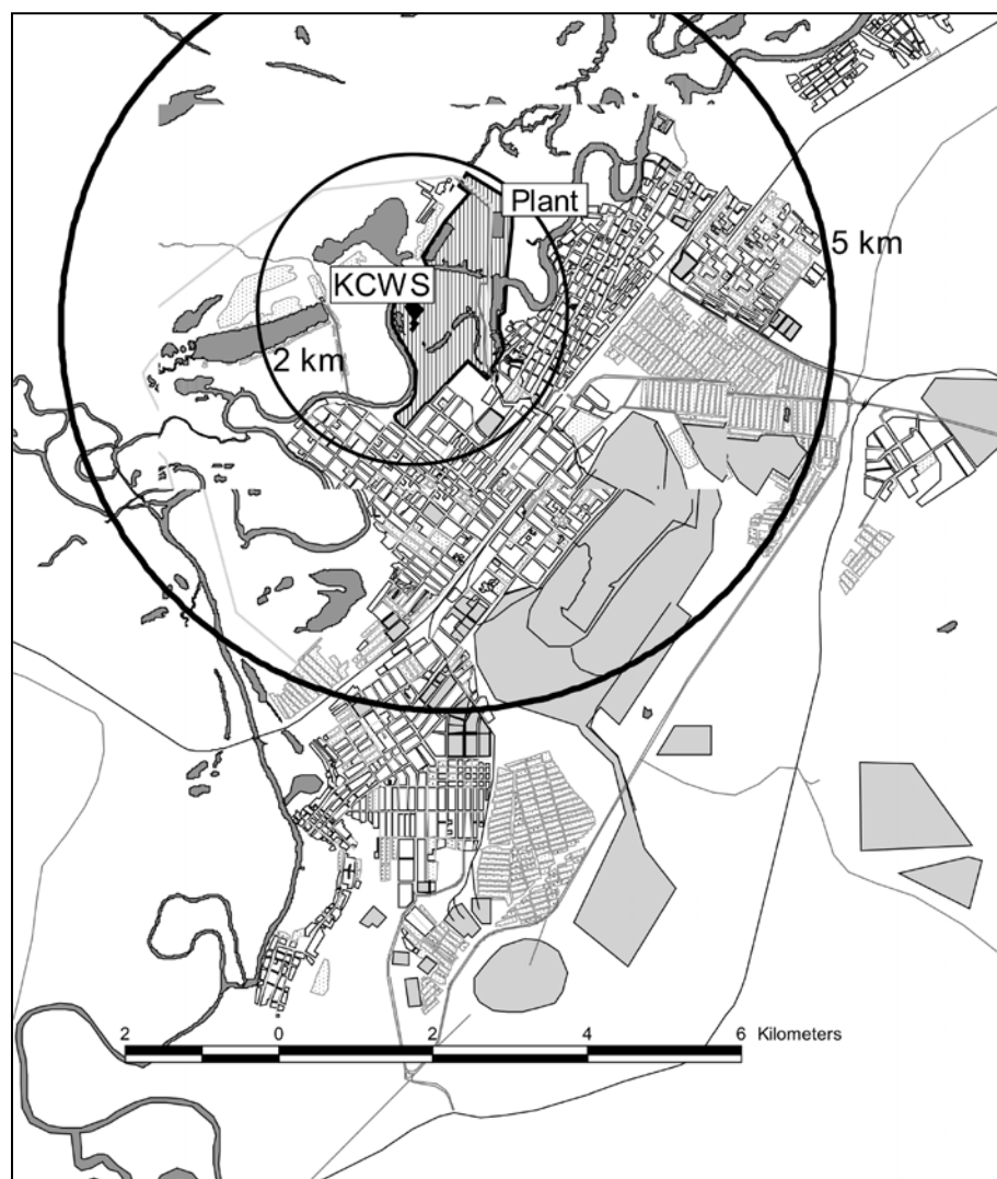
Figure 1. Map of Chapaevsk, location of Khimprom (plant), Khimprom chemical workshop (KCWS).

Dietary information. A validated Russian Institute of Nutrition (RIN) semiquantitative