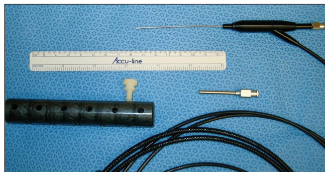
Fig. 1. Our first 4 FiberTech (0.7-mm external diameter) ductoscopes broke during the sterilization process at the junction of the metal scope and the plastic handle. Hospital engineers designed and built the perforated silicone sleeve (lower left), which fits over the scope when not in use to protect the junction and to allow for instrument sterilization. The metal cannula protects the junction when the surgeon uses the scope.

Equipment included a ductoscope (MS-611, model #100–0201, 0.7 mm; FiberTech Co., Ltd.) attached to a fibre imaging system (FT-201, FiberTech Co., Ltd.) that projected an image onto a computer screen. Patients underwent ductoscopy after induction of general anesthesia. After identification of discharge from the duct, the surgeon gently dilated the duct orifice. For dilation we initially used a set of Bowman lacrimal probes (Karl Storz GmbH & Co., size 00–4); later, we worked with hospital engineers to design a cannula that gently increased in diameter over its length. The surgeon inserted and advanced the ductoscope under direct visualization, and manually injected normal saline through the biopsy channel to dilate the duct as the scope advanced. The scope was directed by moving the breast. When a lesion was identified, the surgeon marked the skin over the area. On removal of the ductoscope, the surgeon proceeded with standard duct excision, making sure to remove the marked area. The surgeon completed a data sheet that included an endoscopic description of any visualized lesion. We retrospectively compared the endoscopic appearance with the findings on ductography. We do not routinely order preoperative ductography at our institution; it is usually performed at the discretion of the radiologist.