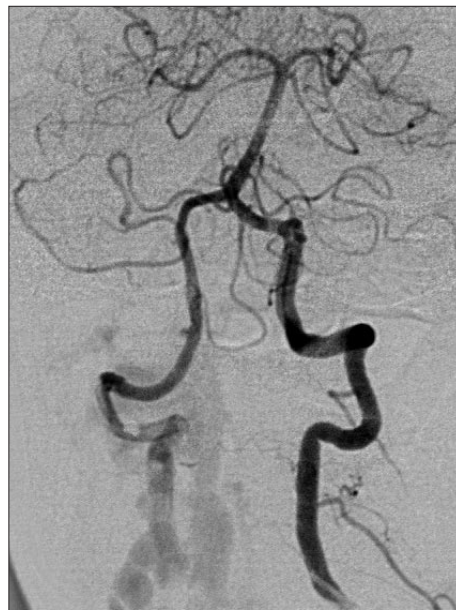
Fig. 1. Left vertebral angiogram (antero-posterior view) shows the ectatic change in the right vertebral artery (VA) and an arteriovenous fistula between the right VA and the vertebral vein

an abnormal dilated vessel on the right spinal canal and adjacent paravertebral area. Bilateral vertebral angiography showed ectatic change in the right VA and an arteriovenous fistula between the right VA and the vertebral vein (Fig. 1).