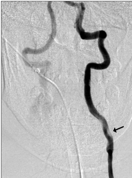
Fig. 2. Follow-up of a left vertebral angiogram suggests vertebral artery dissection with a finding of irregular, filling defect (arrow) of the lumen.