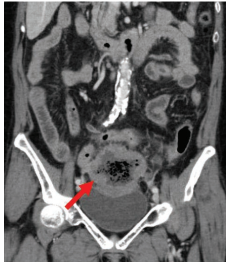
Fig. 1. CT: wall thickening with central necrosis in small bowel and lymphadenopathies near the mass.

ETTL accounts for less than 1% of all non-Hodgkin's lymphomas. It is a subtype of the peripheral T-cell lymphomas in the World Health Organization classification and it is known to develop in 7-10% of patients with longstanding GSE. 1 A patient with ETTL and GSE generally presents with diarrhea, food intolerance, and laboratory findings suggestive of nutrient malabsorption. Immunoglobulin A antigliadin and antiendomysial antibodies are also present in the serum. About 90% of patients with GSE carry the HLA-DQ2 allele. 5 The diagnosis of ETTL requires an adequate biopsy and immunophenotyping. Macroscopically, ETTL is often multifocal, with ulcerative lesions mainly on the jejunum, and there is a high risk of