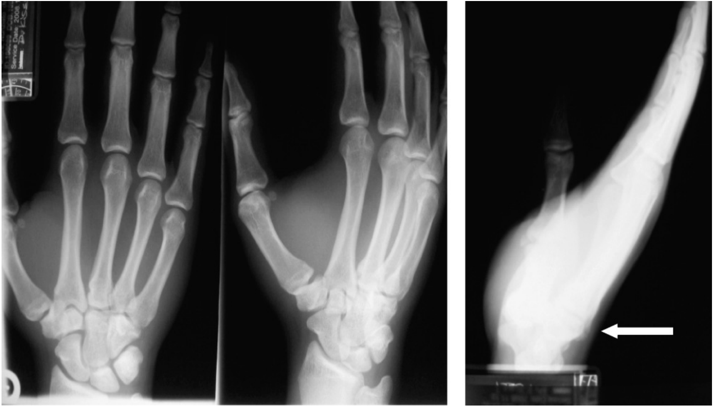
Figure 2 x-ray imaging series with white arrow showing a dorsal projection on the lateral view at the area of the quadrangular joint diagnosed as an os styloideum.

A neurological evaluation including sensory, motor and deep tendon reflexes of the upper limb was performed and deemed within normal limits.