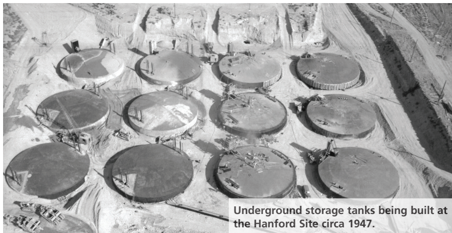
Underground storage tanks being built at the Hanford Site circa 1947.

“They have spent billions of dollars on the tank wastes, and people might wish it were spent more efficiently, but it is not as though we haven’t gotten anything for our money,” he says. For instance, 149 of the 177 tanks are single-walled tanks, and 67 of these are known or suspected to have leaked. Lowenthal says the DOE has transferred the free liquids from all the single-walled tanks to the double-walled tanks.