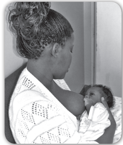
Louise Goosens/Mowbray Maternity Hospital, Cape Town

So what can be done to make it easier for women to choose the breastfeeding option? The government needs to convince industry to make it easy for mothers to carry on breastfeeding after returning to work, says Lulama Sigasana, a nutritionist working at Ikamva Labantu, a South African non-profit organization based in Cape Town. She also believes that mothers should be provided with space and time to express milk in private at work. She says the government could do more to communicate the message that breastfeeding is good. “There are already