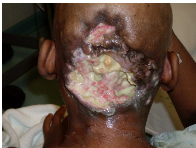
Figure 3 Disease progression on chemotherapy.

South Africa is at the epicenter of the HIV epidemic. Consequently, the management of patients with malignant neoplasms in our context is often compounded by atypical disease presentation and clinical course. This case of