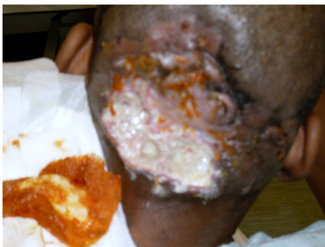
Figure 1 Initial presentation.

Computed Tomography (CT) scan revealed a large heterogeneously enhancing soft tissue mass over the scalp in the occipital region with erosion of the underlying bone. Extensive subcentimetre enhancing lymphadenopathy was noted in the anterior and posterior triangles of the