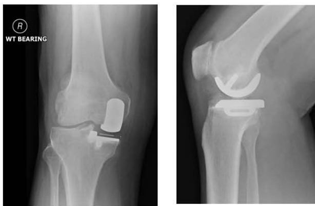
Figure 1 Pre-operative anteroposterior and lateral radiographs of the patient showing medial unicompartmental prosthesis in-situ.

PVNS may be intra- or extraarticular and can present in the diffuse or nodular form with a tendency to bleed and erode bone [1]. Joint effusion can be out of proportion to the mild degree of pain and absence of bloody effusion does not rule out PVNS [1,7,8]. Radiologically there is bone preservation and relative lack of hypertrophic bone or spur formation in PVNS can help differentiate this condition from osteoarthritis [1,8]. The incidence of juxta-articular bone involvement in the knee is less and is postulated to be due to capacious knee capsule and large suprapatellar bursa providing space for tumour like growth of PVNS [1]. Histologically it has multinucleated