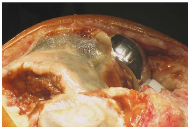
Figure 3 Intra-operative photographs taken during revision to total knee replacement demonstrating pigmentation and arthritis involving the lateral femoral condyle.

giant cells with characteristic pigmentation due to intra- and extra cellular hemosiderin perhaps due to its tendency to bleed [1].