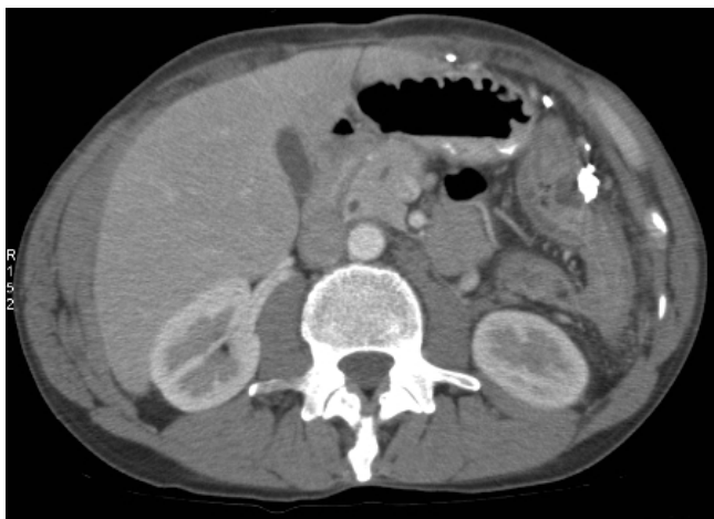
Figure 3 Axial CT image shows the abnormally thickened splenic flexure with surrounding hazy stranding in keeping with inflammation. The colobronchial fistula arises from this loop.

main reason for the delay in investigating the colon and thus making the diagnosis.