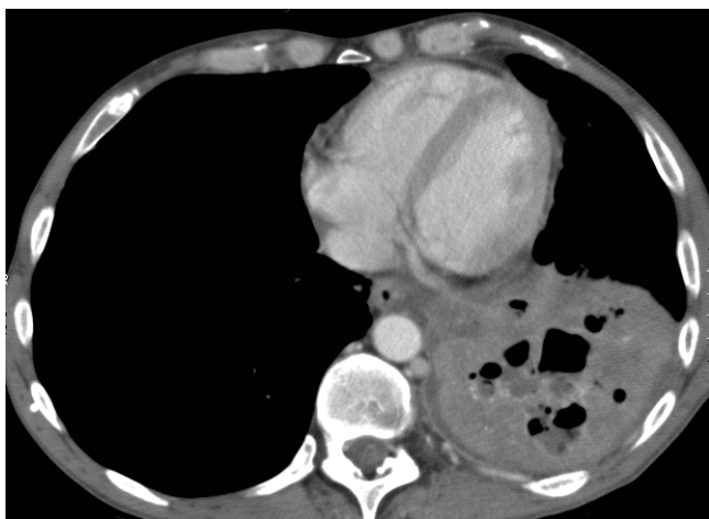
Figure 1 Axial CT image shows a left lower lobe consolidation. Irregular fluid- and gas-containing collections are seen in keeping with cavitation.

The patient was treated with a 6 week course of oral Amoxicillin/Clavulanic acid and was doing well when he was seen in clinic 12 weeks after surgery.