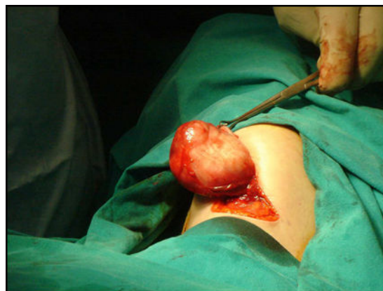
Figure 5 The lesion was removed by external approach through an transverse incision in the left submandibular area extending beyond the midline to the opposite side.

In 1955, Meyer updated the concept of dermoid cyst to describe three histological variants: the true dermoid cyst, the epidermoid cyst and the teratoid variant. True dermoid cysts are cavities lined with epithelium showing keratinization and with identifiable skin appendages such as pilous follicles, and sudoriparous and sebaceous glands on the cyst wall. Epidermoid cysts are lined with simple squamous epithelium with a fibrous wall and no attached structures. The lining of teratoid cysts varies from simple