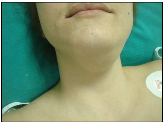
Figure 4 The 35 year-old female presented with a submandibular left-sided neck swelling. The skin over the swelling was intact and normal.

scan showed a large, hypodense, non-enhancing mass arising within the submandibular space. Our first hypothesis was that of ranula, since the clinical aspect was compatible with ranula and because ranulas are far more common than epidermoid cysts. The hypothesis of an infection was discarded due to the period of evolution (6 months) and the absence of pain and of intraoral infectious foci. Malignant tumor was ruled out in view of the lesion's clinical aspect and the absence of lymphadenopathy, although the latter is admittedly an imprecise indicator of malignancy. Fine-needle aspiration biopsy was