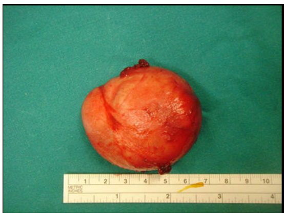
Figure 6 The 2.17 in intact epidermoid cyst of case 2 after surgical removal.

squamous to a ciliate respiratory epithelium containing derivatives of ectoderm, mesoderm and/or endoderm. All three histological types contain a thick, greasy-looking material [5].