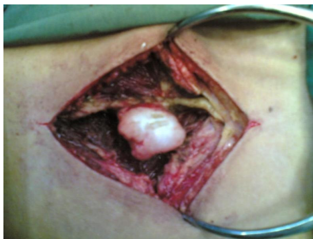
Figure 5 Intraoperative view of osteochondroma of L3 spinous Process.