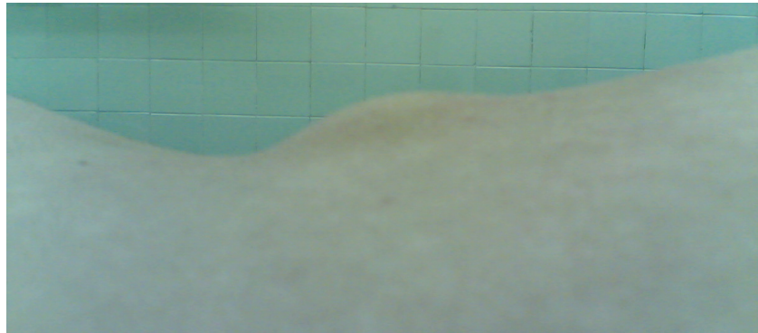
Figure 1 A 16 years old female with lower lumbar osteochondroma.

from the posterior elements of the L3 and rolled out any Congenital anomalies (Figure 2).