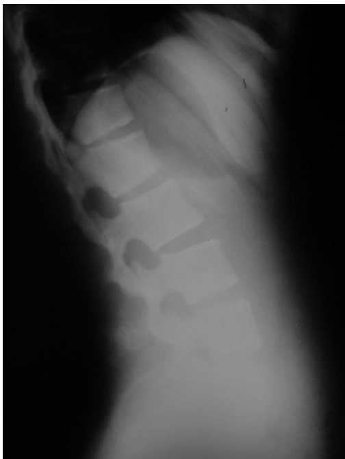
Figure 2 Lateral plain radiography of lumbar with L3 osteochondroma.

The tumor was excised en bloc through a posterior approach (Figure 5). Histopathological examination verified the diagnosis of osteochondroma. During 19 months follow-up, no recurrence was detected.