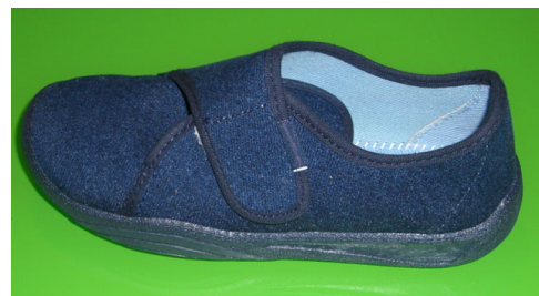
Figure 2 Typical Austrian pre-school indoor shoe.

To test the functional association between hallux angle and the fit of shoes, a logistic regression analysis was performed with "fit" for street and indoor shoes as forced inclusion variables, and gender, age, body weight and body mass index as stepwise inclusion variables. For relative risk calculation, a cut off point of \geq 4 degrees hallux angle was used. The cut-off was chosen based on the max-