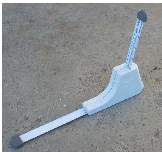
Figure 3 Measuring device for the inside length of shoes.

imum of Nagelkerke's R^2 starting with one degree hallux angle and increasing the angle by one degree at each step.