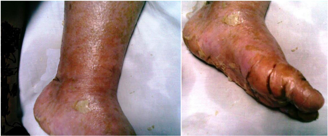
Figure 1 Erythroderma, multiple crusted plaques and pustules in lower limb.

Thyroidectomy was performed for toxic nodular goiter during the second trimester. She developed secondary hypoparathyroidism after surgery. She was not compliant with her medications which included calcium, L-thyroxine and vitamin D.