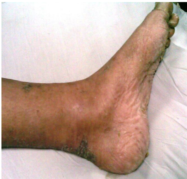
Figure 3 Complete clearing of skin lesions after treatment.

distinct entity. The absence of personal and family history of psoriasis, the association with pregnancy and hypocalcaemia, its recurrence with subsequent pregnancies and the absence of development of chronic plaque psoriasis might suggest that IH is a distinct entity [1,6,7].