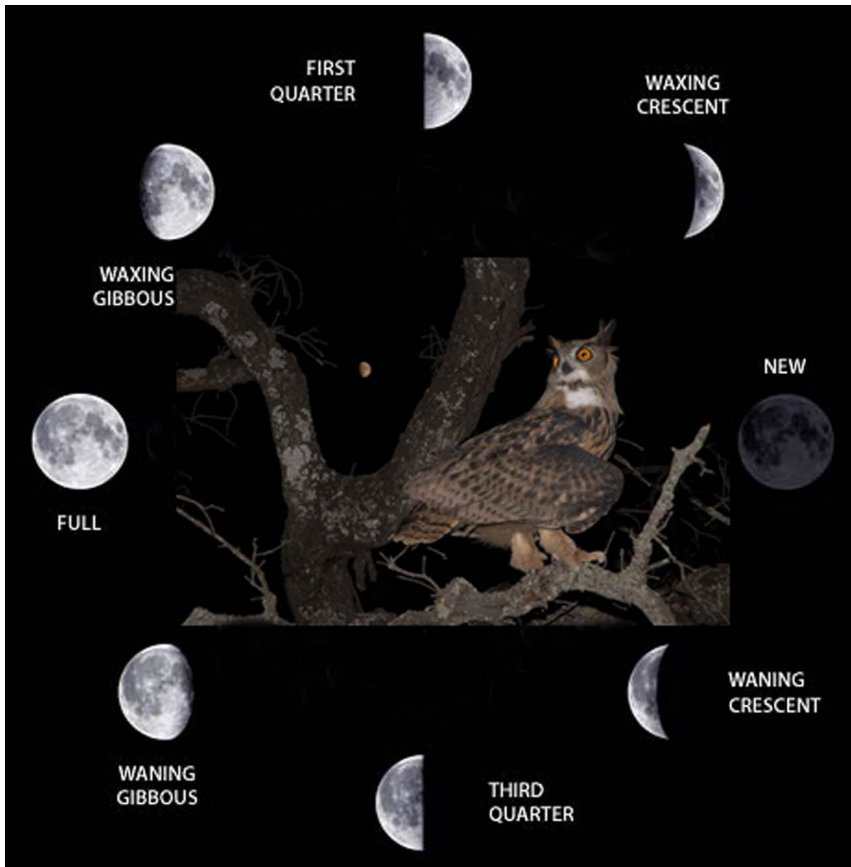
Figure 1. The five lunar phases that have been considered in the analyses (see the text for more details): new moon, waxing/waning crescent, first/third quarter, waxing/waning gibbous and full moon. The waxing/waning phases and first/third quarter moons (often called a “half moon”) have been grouped together because of their equivalent illumination ( http://aa.usno.navy.mil/faq/docs/moon_phases ). doi:10.1371/journal.pone.0008696.g001

conspecifics [16]. Light levels of moonlight are similar to the light levels at dawn and dusk [18], when eagle owls perform the most vocalizations [16]. This could suggest that nocturnal birds simply take advantage of any source of natural light to increase the effectiveness of their visual communication.