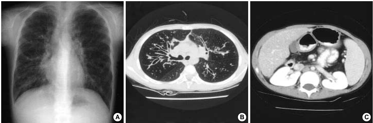
Fig. 1. Radiologic findings of case 1. Plain radiography (A) and computed tomography (CT) scan (B) reveal bronchiectasis. Pancreatic atrophy is found in abdomen CT scan (C).

Hence she was treated with anti-tuberculosis regimen for 9 months, but her symptoms did not improve. When she was 2 yr old, clubbing fingers were noticed, and at 5 yr of age, she received ventilator care due to severe respiratory distress. At that time, Pseudomonas aeruginosa was isolated from her sputum. Since then, her respiratory symptoms were waxed and waned, and she had been hospitalized several times.