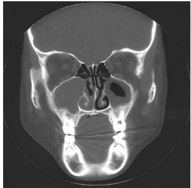
Fig. 3. CT findings, coronal view in case 2. Pansinusitis with polyposis is shown.

The diagnostic test for her immunologic status including CBC, immunoglobulin level, and complement level demonstrated no abnormality. Chest roentgenogram and CT showed diffuse bronchiectasis in the right middle lobe and both lower lobes. The paranasal sinus CT revealed pansinusitis with polyposis (Fig. 3). There was no abnormality in stool examination and pulmonary function test. P. aeruginosa was isolated from her sputum, and nasal mucosal biopsy failed to provide significant information because the biopsy specimens were not adequate. The sweat test was performed repeatedly on separate days by the same method described in the first case. Sweat samples were collected at the average amount of 177.5 mg and 115.5 mg, respectively. Average sweat chloride concentrations of both forearms were 95.0 mM/L and 77.5 mM/L,