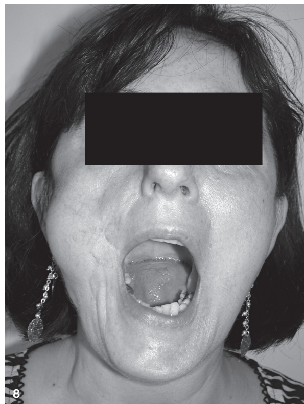
Figs. 5-8. Frontal, lateral, oblique and dynamic results 7 years after surgery.