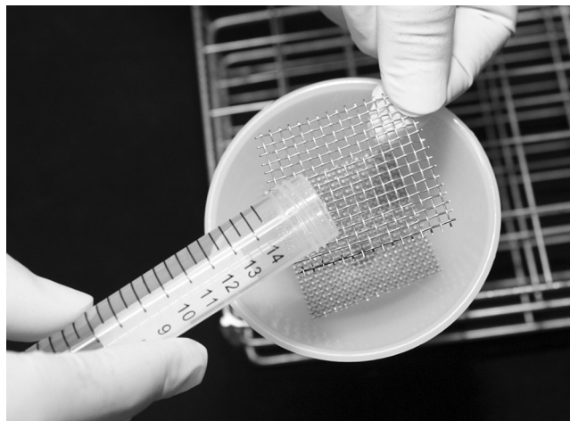
FIG. 2. Straining method through two wire meshes.

Comparative efficacies of five versions of FECT with various factors. Fresh stool (10 g) was suspended in a beaker containing 20 ml of 0.85% saline and then divided equally into five tubes. Three tubes each had 6 ml of 0.85% saline added and were then promptly tested (fresh stools), while the other two tubes each had 6 ml of 10% formalin added and were then kept for 30 min (preserved stools). Five versions of FECT with the following factors were compared: using fresh stool, gauze, and 10-min exposure of larvae to formalin (FECT 1); using preserved stool, gauze, and a short time exposure of larvae to formalin (FECT 2); using preserved stool, wire mesh, and a short time exposure of larvae to formalin