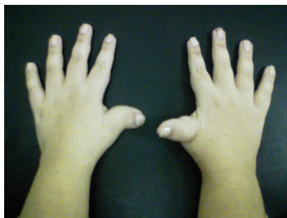
Figure 2 - Broad and radially deviated thumbs

A physical examination at 23 years of age showed a weight of 61 kg (75<p<97.5), a height of 139.5 cm (p<2.5) and an OFC of 49.5 cm (p<2.5). Pertinent physical characteristics were highly arched eyebrows, downward-slanted palpebral fissures, a beaked nose, nasal septum below alae, a highly arched palate and posteriorly angled ears (Figure 1). She also had broad, radially deviated thumbs and broad halluces (Figure 2).