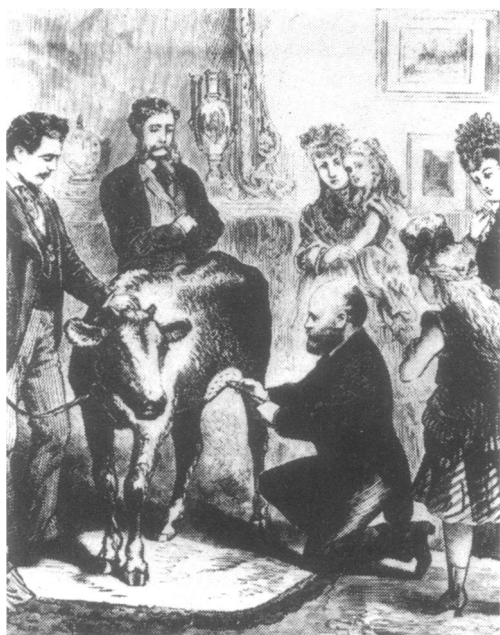
FIG. 14. Vaccination in New York City, circa 1870.

Jenner received many honors and awards from emperors and kings and from various groups and organizations throughout the world. He gave a royal command performance in 1800 when he personally vaccinated the 85th Regi-