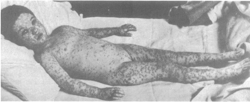
FIG. 18. Classical smallpox (pustular stage) in an unvaccinated child (reprinted, with permission, from Viral and Rickettsial Infections of Man , 4th ed., J. B. Lippincott Co., Philadelphia, Pa.).

fever (with little or no remission throughout the illness), intense headache and backache, restlessness, a dusky flush or sometimes pallor of the face, extreme prostration, and toxicity. In fulminating cases, hemorrhagic manifestations appear on day 2 or 3 as subconjunctival bleeding, bleeding from the mouth or gums, petechiae in the skin, epistaxis, hematuria, and, in women, bleeding from the vagina. The patient often dies suddenly between days 5 and 7 of illness, when only a few insignificant maculopapular cutaneous lesions are manifested. When the patient survives for 8 to 10 days, the hemorrhages develop early in the eruptive phase, with flat lesions which do not progress beyond the vesicular stage.