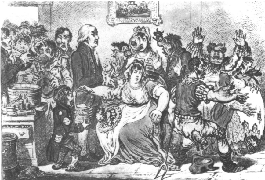
FIG. 8. The Cow Pock by James Gilbray (1757 to 1815)