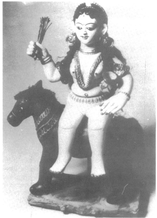
FIG. 21. Shitala Mata (goddess of smallpox in India).

India, Pakistan, and Bangladesh, with a combined population of over 700 million, posed special problems to the surveillance-containment strategy since comparable efforts which proved successful elsewhere did not succeed on the Indian subcontinent. Large numbers of poor people, frequently unvaccinated and sometimes with active smallpox, travelled frequently and far from rural villages to urban centers and back in these densely populated countries because of the availability of a relatively extensive network of railroads and bus lines. As population densities were far greater here than elsewhere, vaccination immunity levels were also remarkably low. In addition, a great number of religious festivals regularly attracted and mixed hundreds of thousands to millions of vaccinated, unvaccinated, and infected people in certain geographic areas. Moreover, among the Hindus, Shitala Mata (Fig. 21) has been worshiped for centuries as the goddess of smallpox, whose blessing of a person was believed to result in the acquisition of this disease. Relatives and friends of a smallpox patient would travel long distances to pay homage. The goddess's annual visits during the