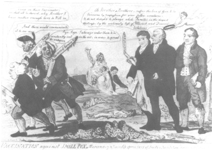
FIG. 11. Vaccination Against Smallpox, a caricature by George Cruikshank (1792 to 1878) depicting Jenner driving out spreaders of death and devastation.

vaccination immediately after the publication of Jenner's An Inquiry in 1798. Sir John Simon (1816 to 1904), the first Medical Officer of Health for London, in his report on vaccination prepared in 1857 for the Board of Health (which was presented to Parliament), regarded Jenner as a saint who could do nothing wrong (Fig. 11).