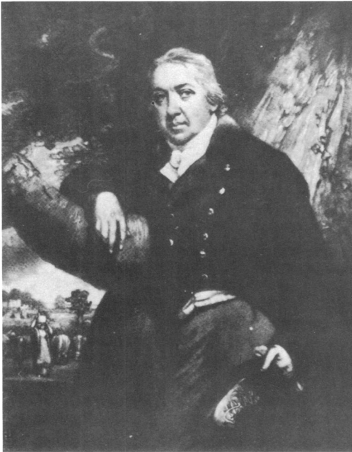
FIG. 6. Dr. Edward Jenner (1749 to 1823).