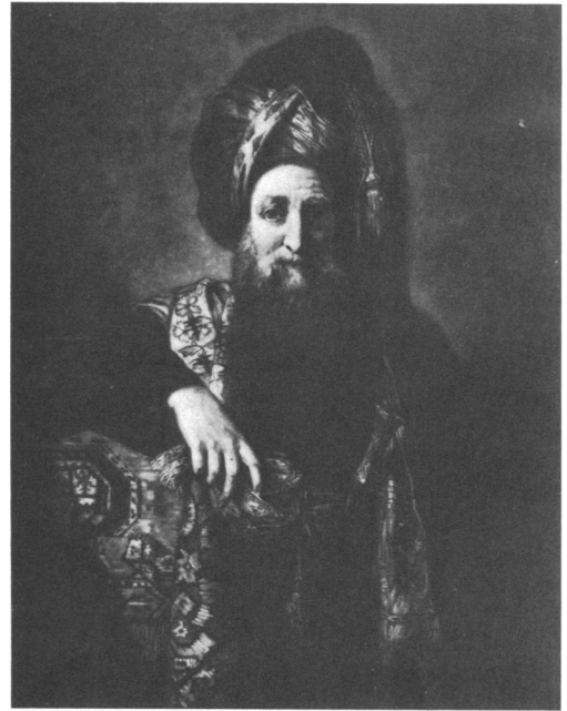
FIG. 4. Edward Wortley Montagu, Jr. (1713 to 1776). In contrast to his younger sister Mary (see the text), Edward grew up to become a rascal and a constant embarrassment to his parents. After a number of boyhood escapades, he was sent to the West Indies and France for education with private tutors and later studied Oriental languages at the University of Leyden, Holland. He became involved in an affair of gambling and robbery in Paris and was imprisoned in The Chatelet for 11 days. Subsequently, he joined the English army and was captured and released by the French. In 1747, through the favor of his cousin, Lord Sandwich, he was elected Member of Parliament for Huntingdon. However, Lady Mary, who was repeatedly anguished by his follies, succinctly remarked that her son would never amount to anything (46).