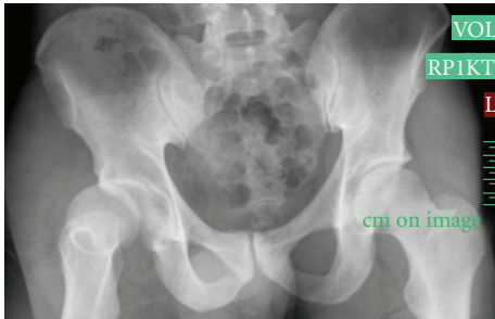
FIGURE 1: Plain radiograph of the pelvis shows a dislocated right hip.