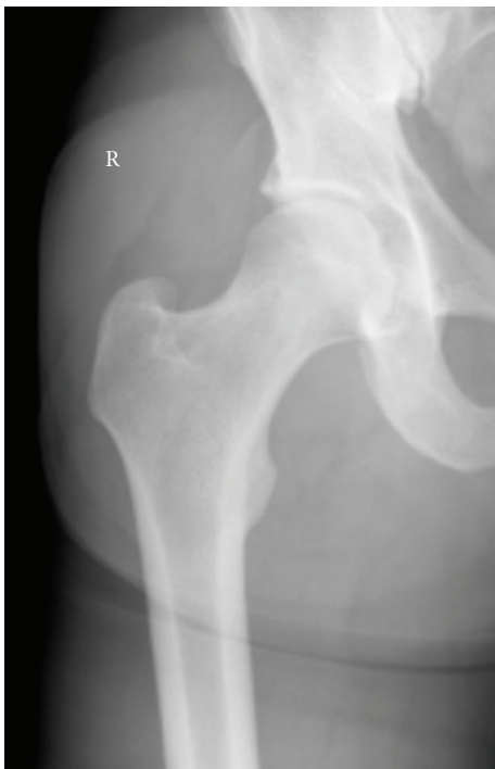
FIGURE 2: a/p X-ray one week after closed reduction shows a congruent hip joint and no fracture signs.