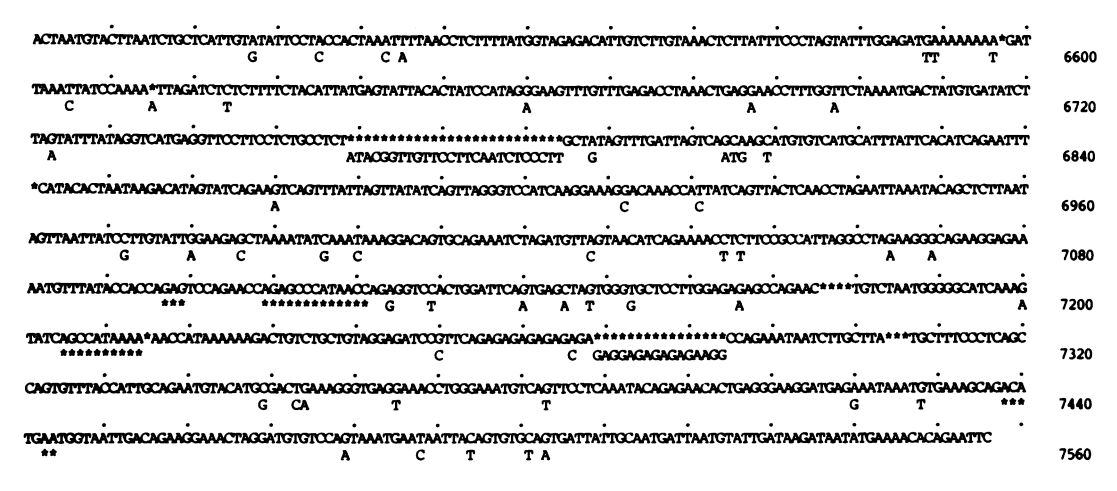
FIG. 1. Aligned DNA sequences of the \psi\eta -globin flanking regions for Homo sapiens and Macaca mulatta (upper and lower lines, respectively). Only nucleotides at variable sites for rhesus macaque and only regions corresponding to sequence obtained in this study are shown. The location of the Koop et al. (15) sequences is represented by the double row of + beginning after position 1999. The entire 10.8-kbp alignment is divided into upstream (positions 1–7556) and downstream (7551–10760) regions by the Eco RI site (7551–7556) signifying the start of the Maeda et al. (18) sequences. The human orthologue represented here is that of Collins and Weissman [CW (16)], as corrected by Miyamoto et al. (19). The nucleotide alignments of Koop et al. (15), Maeda et al. (18), and Miyamoto et al. (19) are followed in this study. To preserve the entire 10.8-kbp alignment, gaps (asterisks) are sometimes retained between human and rhesus macaque even in the absence of polymorphism (i.e., position 1555). All five species share an Alu repeat element with a downstream orientation at positions 1424–1756 (27). In contrast, a unique Alu repeat with an upstream orientation is exhibited by rhesus macaque at sites 1018–1334.

are known from Collins and Weissman [CW (16), as corrected by Miyamoto et al. (19)], Chang and Slightom [CS (24)], Maeda et al. [R and T (18)], and Poncz et al. [PONCZ (25)], respectively. By including all five alleles, a better representation of sequence variation (polymorphism) in humans was incorporated in our analysis of higher primate relationships.