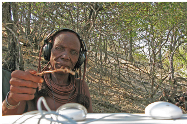
Fig. 1. Participant watching the experimenter play a stimulus ( Upper ) and indicating her response ( Lower ).

narios and does not require participants to be able to read. The English sounds were from a previously validated set of nonverbal vocalizations of emotion, produced by two male and two female British English-speaking adults. The Himba sounds were produced by five male and six female Himba adults, and were selected in an equivalent way to the English stimuli (13).