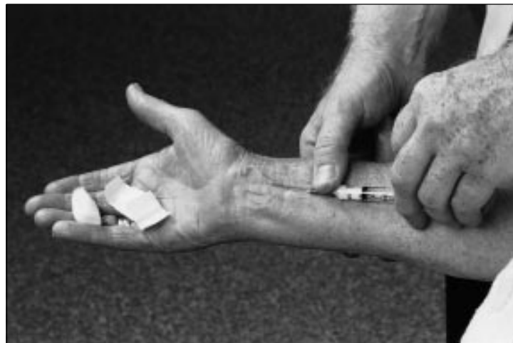
Fig 1 Site for injecting corticosteroid to treat carpal tunnel syndrome

The participants were patients referred to the Medical Centre Alkmaar with signs and symptoms of the carpal tunnel syndrome of more than 3 months' duration confirmed by electrophysiological tests. In those with bilateral symptoms, the arm with the most severe symptoms was chosen, and treatment of this arm was randomised. We excluded patients aged under 18 years or patients who had already been treated for symptoms of the carpal tunnel syndrome.