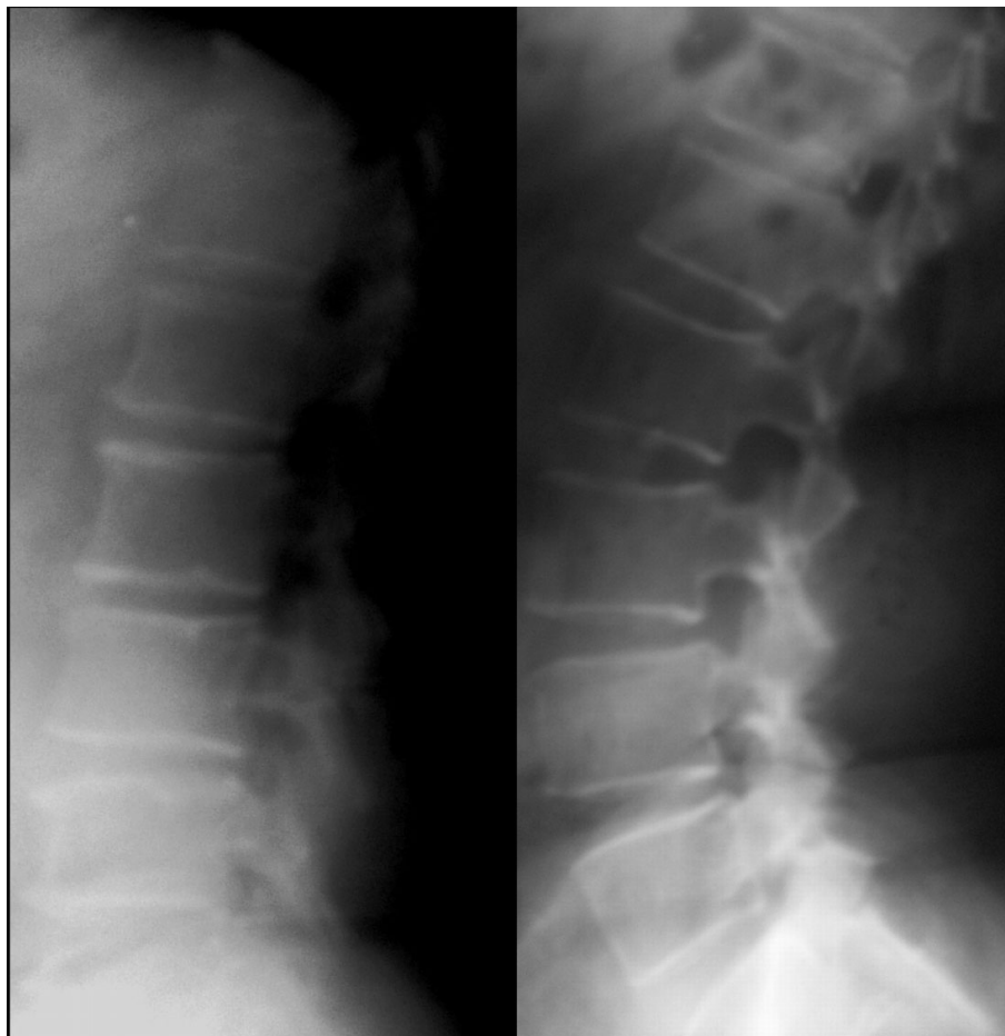
Figure 3 Left: OA patient with minimal lordosis; L 1 - L 5 6°, L 1 - S 1 28°, L 5 - S 1 21°. Right: OA patient with exaggerated lordosis; L 1 - L 5 51°, L 1 - S 1 70°, L 5 - S 1 19°.

The lack of statistically significant differences in our study can be partly explained by the fact that each person has a unique posture and spinal curvature. What constitutes deviation from the correct alignment and abnormal loading, that could induce degenerative changes on the lower spine, is probably a personalized characteristic. In a similar rationale, lumbar lordosis has a wide range of