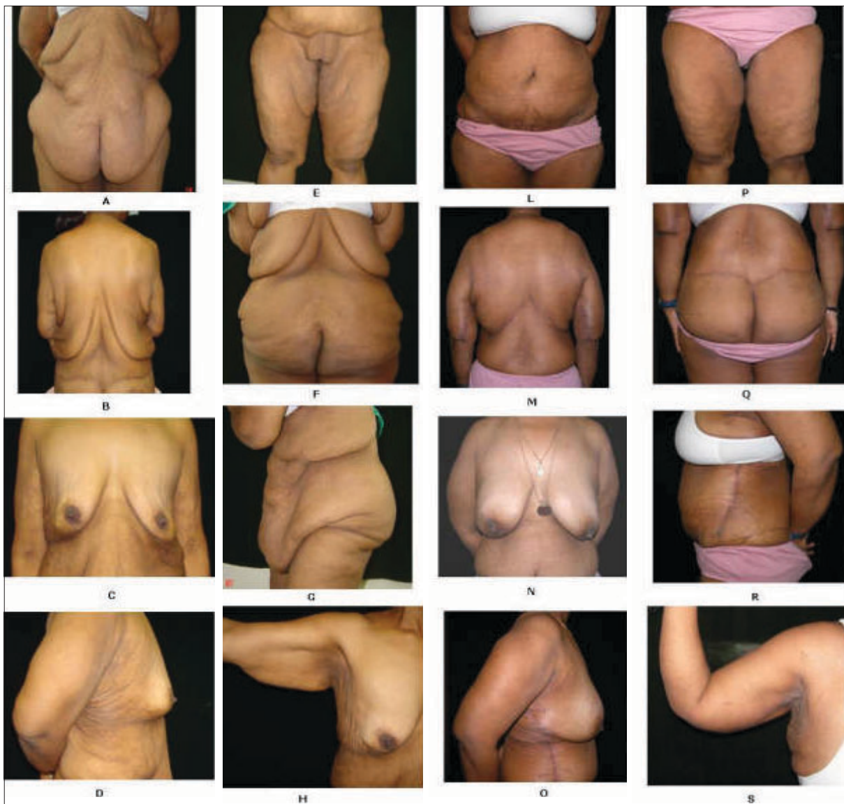
Figure 1: A 26-year-old female after weight loss of 90Kg by dieting and exercise. Figs. 1A to H are preoperative pictures showing contour deformities after massive weight loss. Figs. 1L to S are pictures showing the result after five body contouring procedures which included a circumferential belt lipectomy, upper body contouring, augmentation mastopexy, lateral thoracic and abdominal excisions, brachioplasty and thighplasty

Song et al. [11] have designed an all inclusive and illustrative classification system that helps in systematically assessing and quantifying the level of deformities in each particular region. Ten anatomical areas delineated for analysis include arms, breasts, abdomen, flank, mons, back, buttocks, medial thigh, hips/lateral thighs, and lower thighs/ knees. Because of their complexity, face and neck