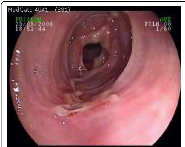
Figure 1 A serpiginous, in part circumferential mid-esophageal ulcer extending to the distal portion in the presence of normal squamo-columnar junction.