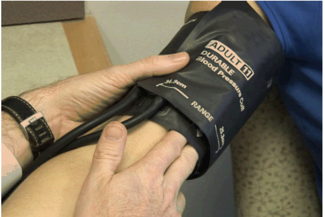
Figure 3. Proper positioning of the blood pressure cuff

A cuff of appropriate size is wrapped around the bare upper arm. It should be well-fitting and snug, but still allow two fingers to fit under the cuff. The lower end of the cuff should be approximately 2 cm above the elbow crease. The midline of the bladder should be placed over the brachial artery.