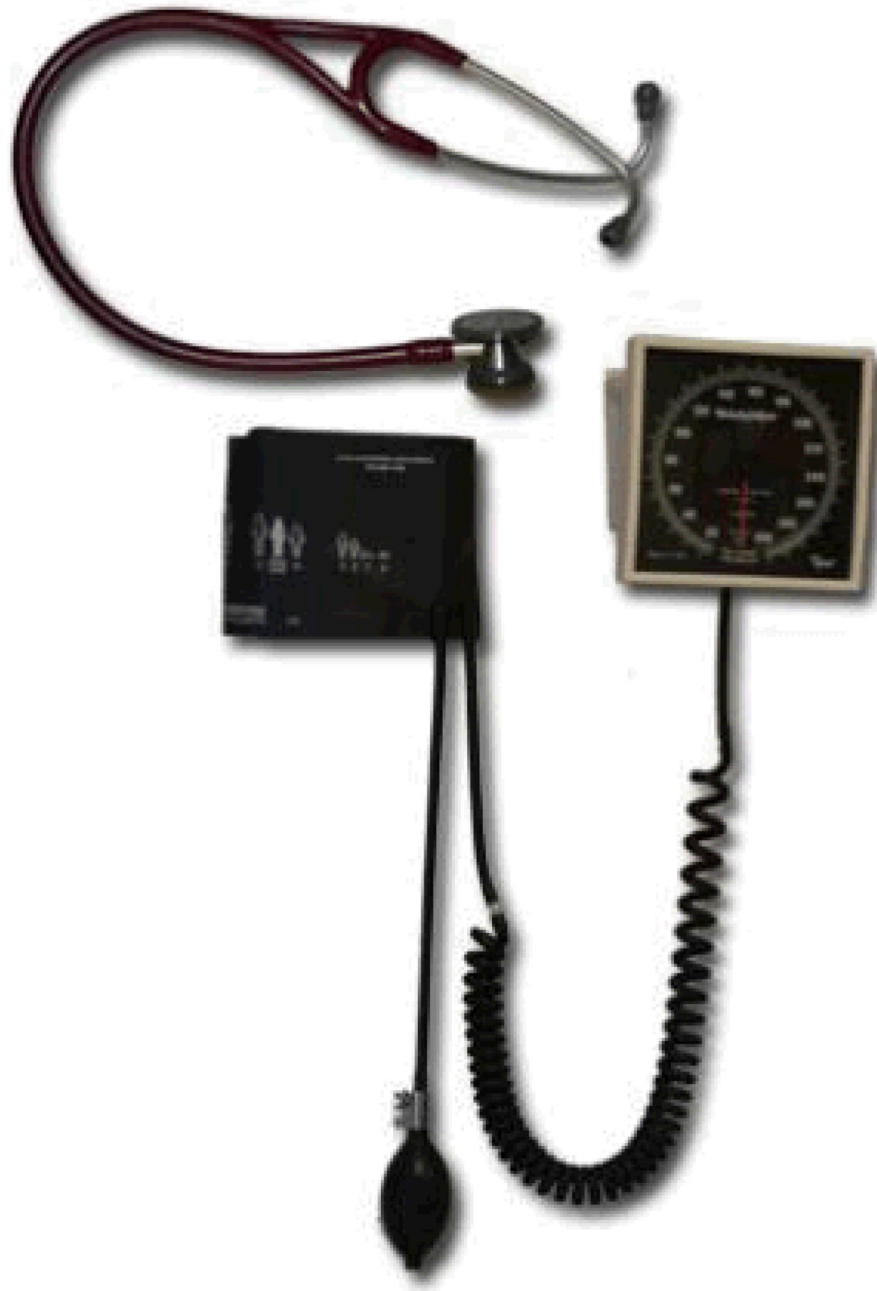
Figure 1. Equipment used in blood pressure measurement

The essential equipment for blood pressure measurement includes a stethoscope and a sphygmomanometer. The stethoscope should have tubing of sufficient length to allow auscultation of Korotkoff sounds while viewing the manometer at eye level. The sphygmomanometer includes a blood pressure cuff with a distensible bladder, tubing connected to the cuff and a rubber bulb with an adjustable valve for coordinating inflation and deflation, and a manometer to display the pressure level in the cuff.