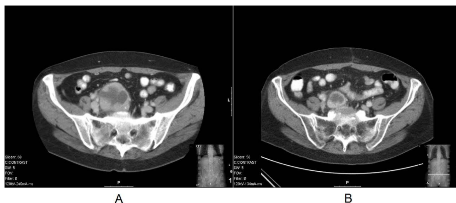
Figure 1 A: Computed Tomography (CT) of the abdomen showing the tumour and its relationship with the sacral vertebra, the adipose tissue and the common iliac artery and vein, before neo-adjuvant radiotherapy. B: Computed Tomography (CT) of the abdomen showing the marked downsizing of the tumour, after neo-adjuvant radiotherapy.

the unicentric as well as for the multicentric form of CD [9,10,21-23,25-30,32,33]. Table 1, presents an overview of all studies that have evaluated the use of primary radiotherapy in CD, both for unicentric and multicentric disease, with doses ranging from 12 to 50 Gy [4,8-10,22-30,32,34,35]. Responses to primary radiotherapy for the treatment of both forms of CD ranged from no response to a complete response. Nevertheless, 88% of all CD patients treated with radiotherapy showed a response, of which 43,8% showed a complete response.