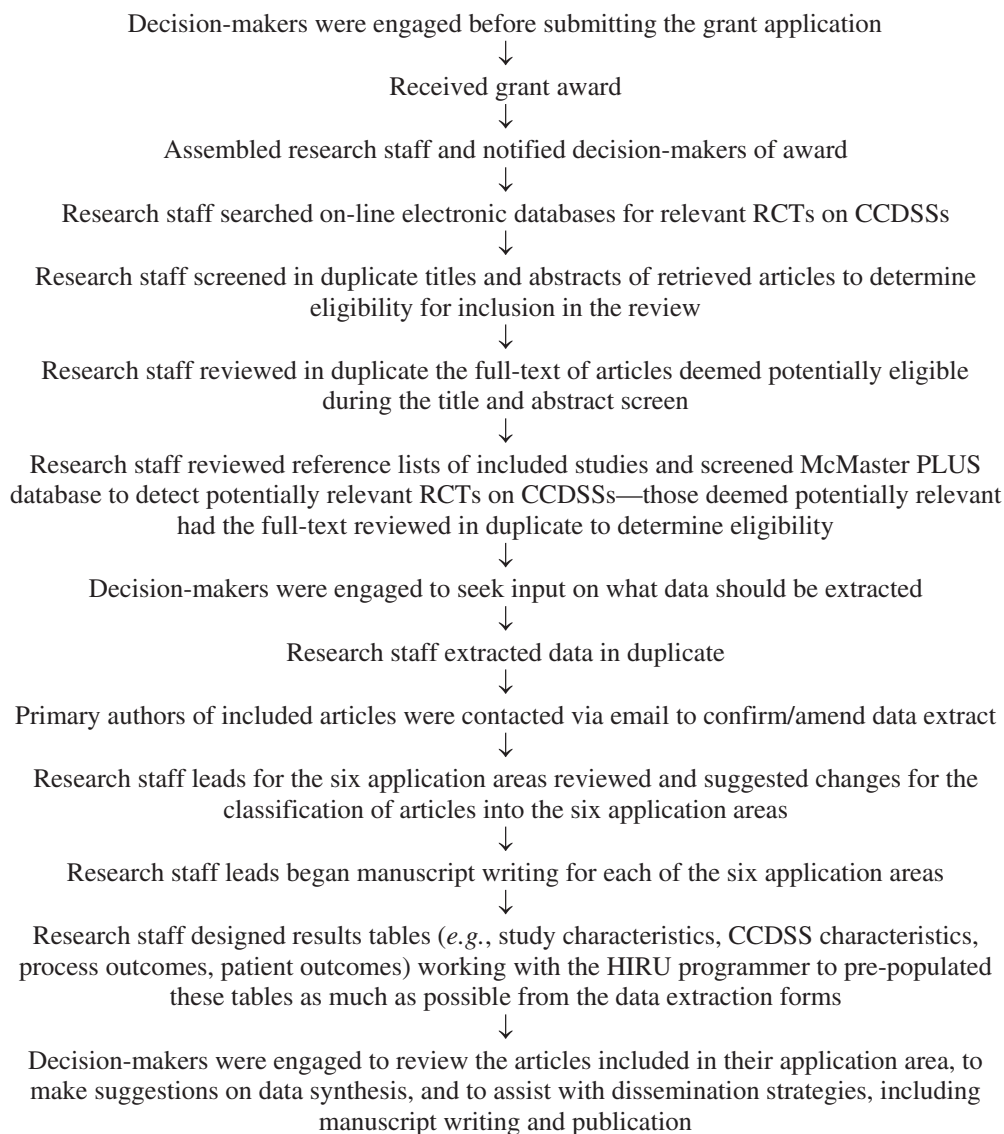
Figure 1 Flow diagram of steps involved in conducting this review.

and Brant Local Health Integration Network (LHIN)), and clinical service chiefs at local hospitals. The partnership recruited leading local and regional decision-makers to inform us of the pertinent information to extract from studies from their perspectives as service providers and managers. Our partnership model was designed to facilitate KT, that is, to engage the decision-makers in the review process and feed the findings of the review into decisions concerning IT applications and purchases for our health region and its large hospitals.