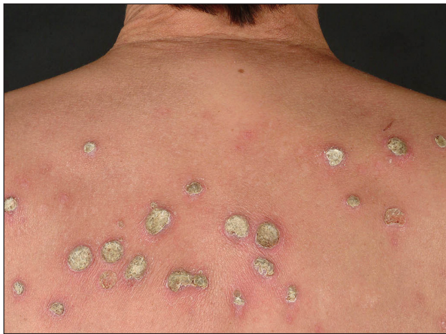
Figure 1: Numerous erythematous plaques with central keratotic plugs on the upper back of a 58-year-old woman.

A 58-year-old woman with diabetes mellitus and chronic kidney disease who was receiving hemodialysis presented with a five-month history of pruritic skin lesions on her upper back. Examination showed numerous erythematous papules and plaques with central keratotic plugs (Figure 1). Histopathologic evaluation of a representative lesion showed transepidermal elimination of necrotic collagen bundles into a cup-shaped epidermal depression (Figure 2). Acquired reactive perforating collagenosis was diagnosed. All necrotic debris was removed by curettage. Treatment was started with betamethasone valerate cream 0.1% twice daily for four weeks and narrow-band ultraviolet-B phototherapy five times weekly for two weeks, then three times weekly for four weeks. Nearly all the skin lesions cleared with treatment.