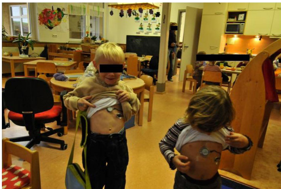
Figure 3 Preschool children happily presenting their accelerometer.

Waist circumference is measured directly on the skin half-way between the top of the iliac crest and the lower rib at the end of gentle expiration [41] with an accuracy