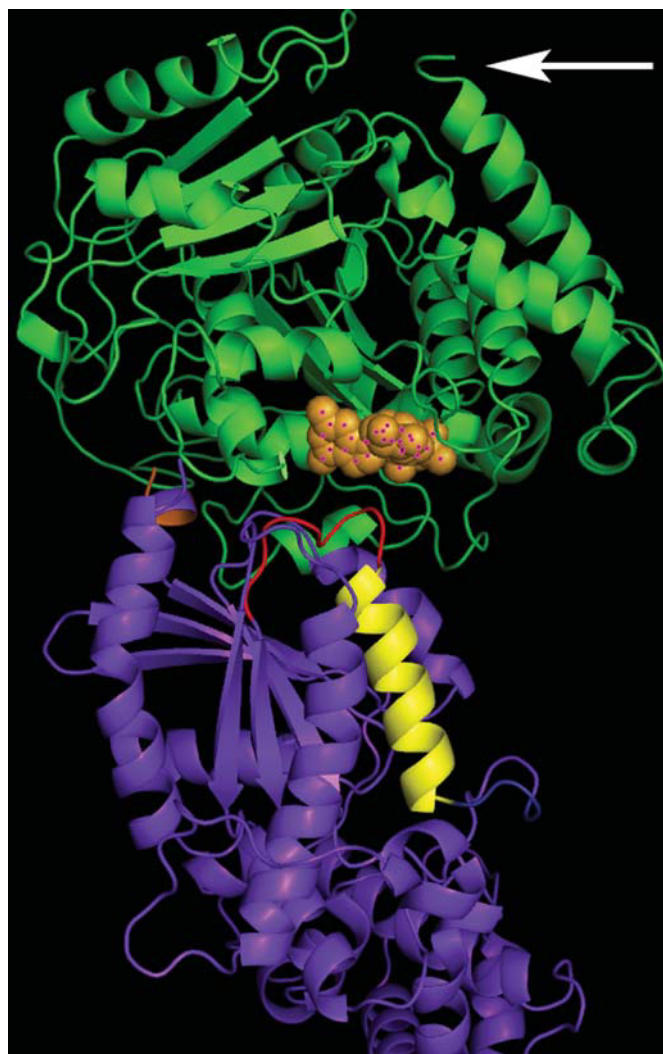
Fig. 1. Molecular model of G \alpha complexed to tubulin. Molecular modeling was used to visualize the G \alpha -GTP \cdot tubulin-GDP complex. Tubulin is in green (top); G \alpha is in blue (bottom). The C-terminus of tubulin is indicated by an arrow, and N-terminal residues on G \alpha are shown in orange. Note that the guanine nucleotide on tubulin (orange spheres) is located near G \alpha , thereby allowing G \alpha stimulation of tubulin GTPase activity. Also, the \alpha 3- \beta 5 loop (red), but not the \alpha 3 helix (yellow), on G \alpha is in close proximity to tubulin. The former region undergoes a large conformational change upon G-protein activation, and is also involved in the interface with adenylyl cyclase and G \beta\gamma subunits. This model was generated using ZDOCK and ClusPro [31]. The crystal structure of bovine G \alpha -GTP \gamma S was solved as a dimer (resolution 2.30 Å, short form) [78]. One G \alpha was deleted along with its corresponding ligands. In the remaining G \alpha molecule, the Mg ^{2+} and PO _4^{4-} molecules were deleted while GTP \gamma S was included for the final docking structure. Since the sulfur of GTP \gamma S is not included in the GNP (part of the CHARMM file), the parameters for the sulfur in Cys were used. ClusPro parameters were 9 Å radius and 1,500 electrostatic hits. Interface residues were defined as any two residues (on different proteins) being within 5 Å of each other. Interacting residues were less than 4 Å apart.

actions appear to involve activated G \alpha [46]. Note that although G i\alpha , G s\alpha and G q\alpha bind tubulin, G s\alpha is the only heterotrimeric G-protein known to internalize. Therefore, G s\alpha -tubulin interactions are likely regulated by receptor activation, which causes G s\alpha to internalize and interact with microtubules. G \beta\gamma subunits also translocate and associate with microtubules subsequent to agonist activation [40].