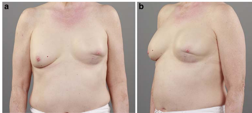
Fig. 3 Appearance of left and right breast 9 months after placement of bilateral permanent implants

tissue reconstruction, the two-stage reconstruction is the most commonly performed method [7], mainly because of its relative simplicity, short operating time, lack of donor site morbidity, and quick patient recovery.