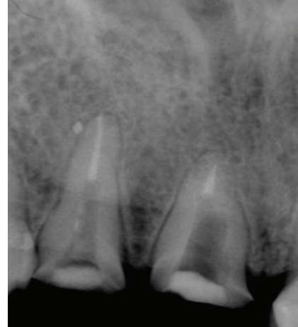
FIGURE 2: The post space should be dressed between appointments and irrigated before post cementation.

Temporary fillings, in teeth undergoing root canal treatment or before completion of the final restoration, must provide an effective barrier against salivary contamination of the root canal. Intermediate Restorative Material (IRM), Cavit, and TERM are commonly used as temporary filling materials [20]. IRM, that is used due to its high compressive strength [21], has been demonstrated in bacterial leakage to be less leak proof than Cavit and TERM [20, 22]. These results were similar to those reported by others, in experiments