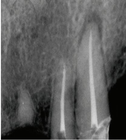
FIGURE 1: Bacterial contamination occurred after completion of root canal treatment in the tooth, which remained with a temporary filling for 15 month.

after 22 days of exposure to saliva. Both lateral and vertical condensations methods of obturation were evaluated in this study [11]. Additionally leakage of obligate anaerobes and bacterial metabolites along laterally condensed root canals was demonstrated without any significant differences between root canals obturated with gutta-perch cones (GP) and other root canal sealers [12–14].