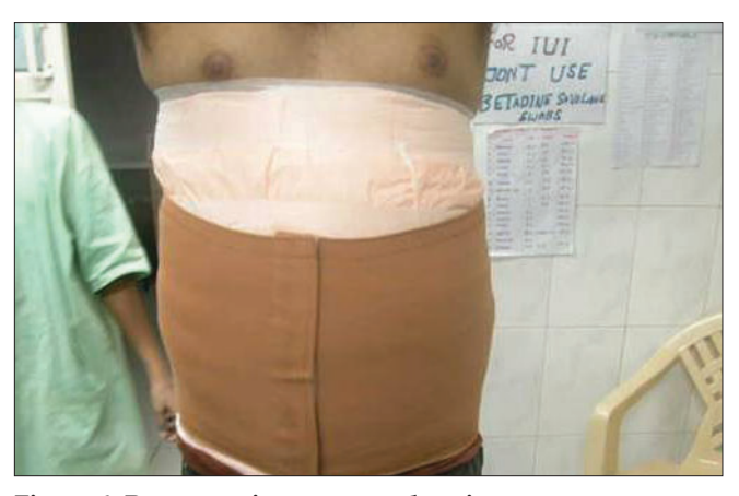
Figure 6: Postoperative pressure dressing

the patient engaged by having a television or music in the theatre during the entire procedure.