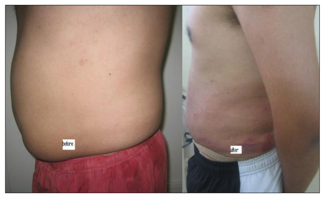
Figure 7: Liposuctions results, case 1