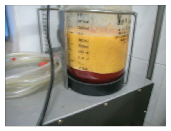
Figure 5: Fat aspirated; note the small amount of blood