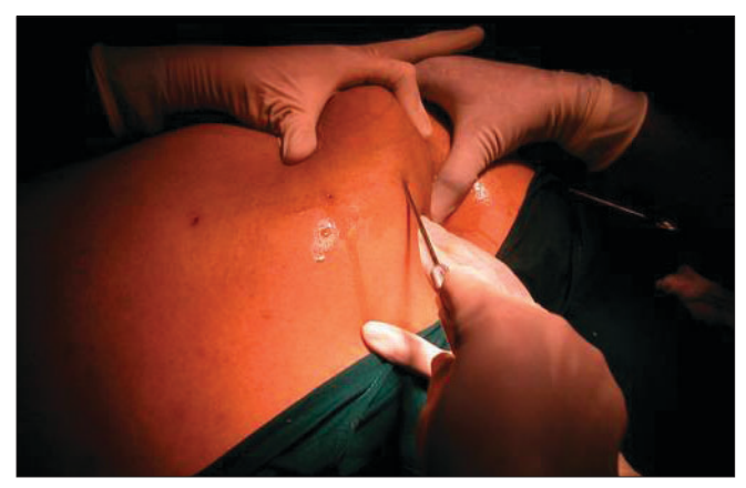
Figure 4: Aspiration of fat

administered preoperative antibiotics such as cephalexin, and a tranquillizer such as oral lorazepam 1 mg. Oral Clonidine 0.1 mg is also administered to prevent epinephrine-induced tachycardia and as an adjuvant anxiolytic drug. The area for liposuction is topographically marked with marker ink to delineate the bulges and asymmetry [Figure 2]. Preoperative photography is vital.