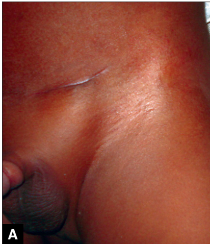
Figure 2A: Appearance of herniotomy scar at 12 weeks (subcuticular suturing technique)