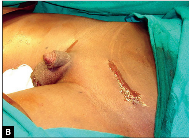
Figure 1B: Perioperative appearance of herniotomy scar (tissue glue technique)