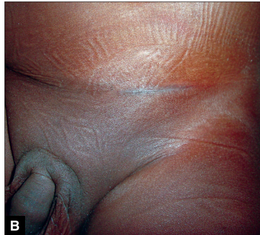
Figure 2B: Appearance of herniotomy scar (tissue glue technique)

in Western countries and Asia with a few reports from Africa; hence the motivation for this study.