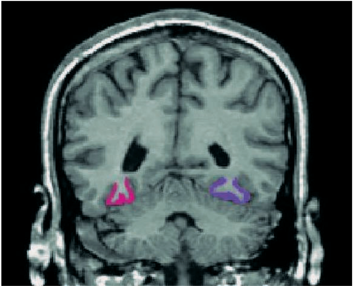
Fig. 1. Manual tracing of right (pink) and left (purple) fusiform gyrus on a coronal image of SPD subject.