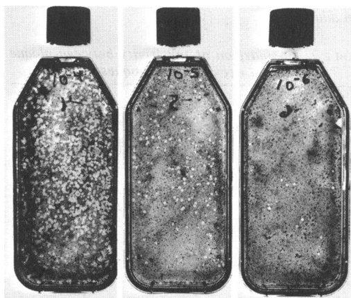
FIG. 1. Plaques in chick primary cells due to Rickettsia rickettsii . The three 10-fold dilutions ( 10^{-4} , 10^{-5} , 10^{-6} ) of a suspension contained 10^{8.4} YSLD 50 /ml ( \log_{10} ).

Effects of variables and procedural modifications. M199 containing 5% calf serum and BHI were compared as diluents for the plaque procedure on CE cells. Both diluents were shown to be equally suitable with two different rickettsial seeds (Table 3). The rickettsiae were