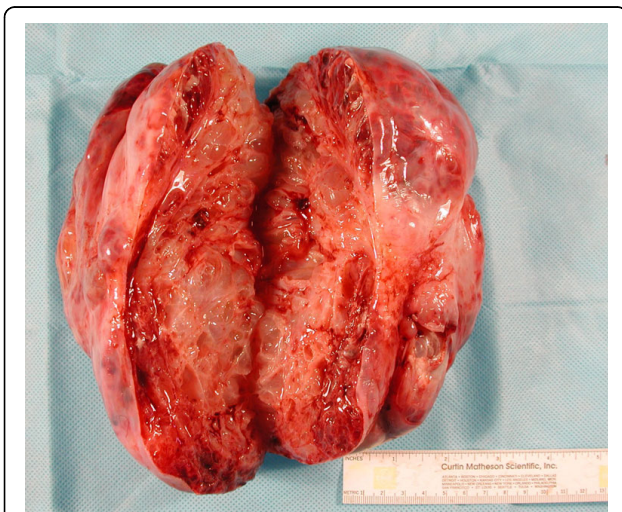
Figure 1 Gross specimen with clearly defined cystic and mucinous component (40× magnification).

Mucinous ovarian adenocarcinomas are uncommon and account for only 10% to 15% of reported cases of